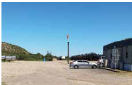
ROOM TO GROW—Five acres have been added to accommodate a new office and trailer parking at Superior Bulk Logistics’ transload site at Curtiss.